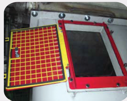
Door opened. Safety screen opened.