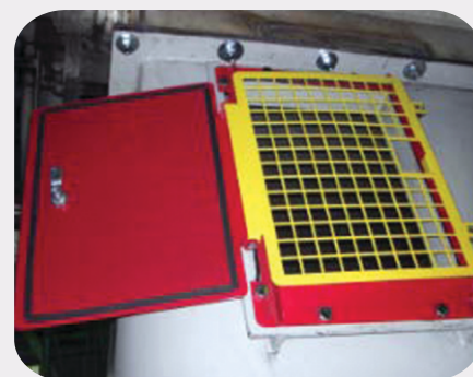
Door opened. Safety screen closed.