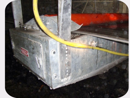
Fully enclosed to provide excellent cleaning while containing the wash waste fluid.