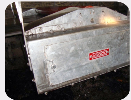
Removable inspection door on each side, with wash down hose included.