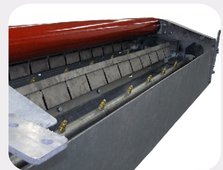
Each steel enclosed box is equipped with a combination of pressure rollers, spray bars and Razor-Back belt cleaners.