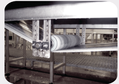
Shown at a cereal plant.

Food Grade Tru-Trainer training idler is designed and proven for training lightweight conveyor belting in the food and material handling industries.