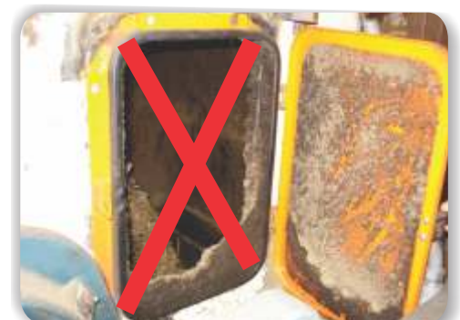
Current inspection door allows for unsafe access to running equipment.