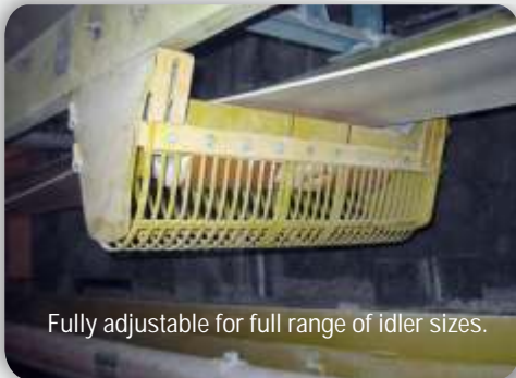
Fully adjustable for full range of idler sizes.

SAFE-GUARD Catches the Return Idler or Material if it Falls and Eliminates Pinch Points!!!