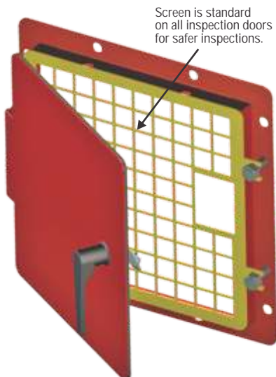
Screen is standard on all inspection doors for safer inspections.