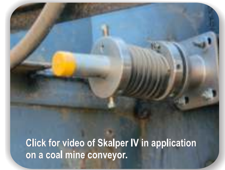
Click for video of Skalper IV in application on a coal mine conveyor.