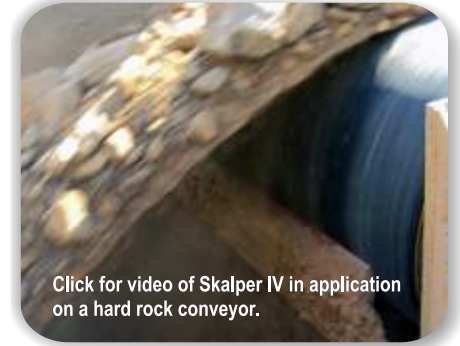
Click for video of Skalper IV in application on a hard rock conveyor.

The Skalper blade design maintains an effective cleaning edge with it's unique horizontal sipes/wear-grooves across the entire width of the blade. The use of the straight front side of the blade and the arch-shaped back side of the blade ensure a continuous sharp cleaning edge.