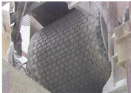
Ceramic Lagging on a conveyor belt at an international cement plant.

The facility had a problem with the conveyor belt slippage and excessive wear on the rubber pulley lagging on two feeder conveyors, according to ASGCO vice president Aaron Gibbs. The first was the FH1001 conveyor, which is a 48-inch wide feeder under a truck dump that experienced numerous belt slippage problems, especially when the plant would try to start the belt with a full load on the feeder.