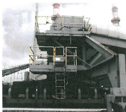
Fig. 2: The old chute would build up and plug with coal fines that stuck together when in wet coal or freezing conditions.