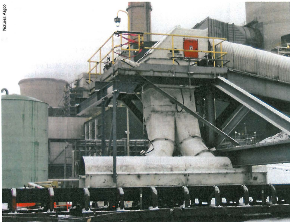
Fig. 1: Modern chute design eliminates plugging and buildup and reduces dust generation in the conveyor load zone.

The author is President of Asgco Manufacturing, USA, Tel. +1 610/821-0216, E-Mail: info@asgco.com