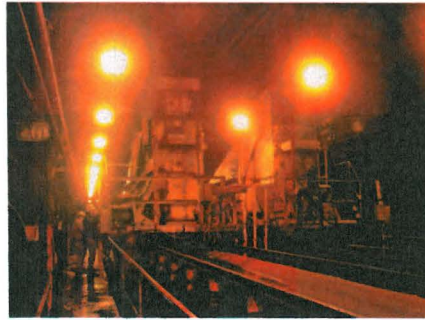
Fig. 4: The major problem with this dual tripper car system were the large amount of airborne dust created from handling coal.

Another major concern for plants handling coal is in bunker house or on the