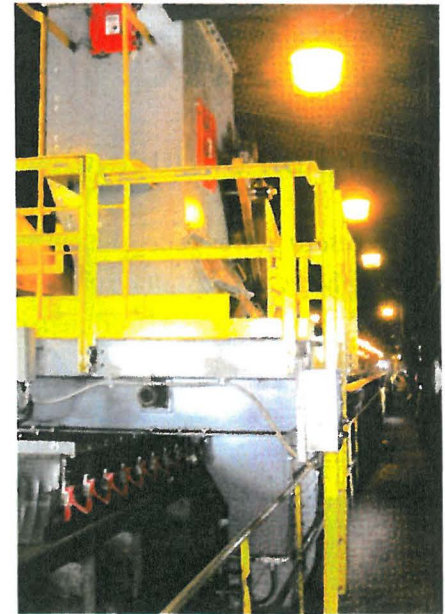
Fig. 5: The newly installed transfer chutes operate with improved coal flow through the tripper system.

tripper/cascade floors where the coal is being loaded into the bunkers or silos prior to being pulverized and being injected into the boiler.