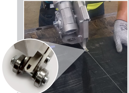
The guide ensures for precision cutting